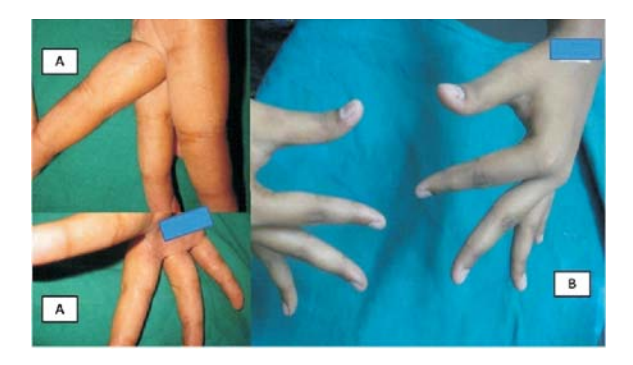
Figure-6: Pompholyx-(A) before treatment (B) after treatmentcomplete response.

In twenty nail dystrophy (n=2) both showed no improvement. None of the patient of GA (granuloma annulare) group (n=2) showed response in this study during